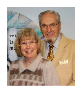
Bible Explorations, Inc. P.O. Box 10965 Terra Bella, CA 93270