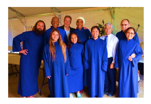
feast." (1 Corinthians 5:7, 8) The meetings were truly Christ centered and brought out the need to have complete confidence in our Father and His word, and to exalt Him over some of our human theories and speculations. We continue to realize that we have many things to learn, and many, many things to unlearn. And we are determined to learn the right things. Study, study, study!

We had a baptismal ceremony as well where several dedicated their lives to the service of our Lord. The bible tells us that these times are times to bring to remembrance the work which was done on the cross for us. "Christ our Passover is sacrificed for us, therefore let us keep the